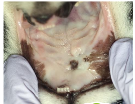
1 Yr 5 Mos Follow-Up

Ossiflex is a thin, flexible sheet of natural demineralized cortical bone that effectively closes palatal and other cranio-maxilo-facial defects.