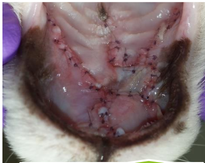
1 Week Follow-Up